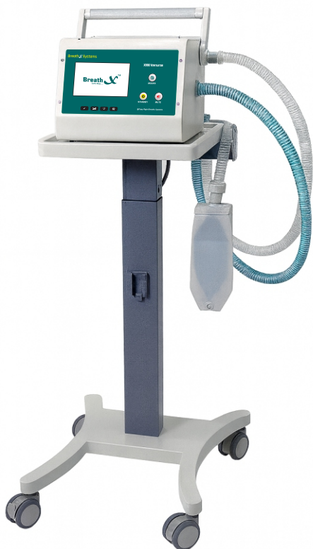
X800 (5" In)